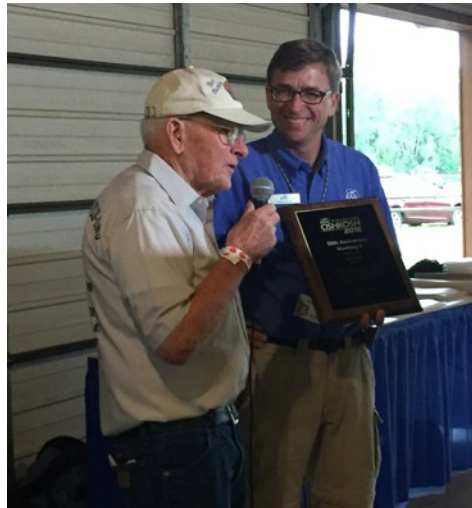
Robert Bushby award at OSH