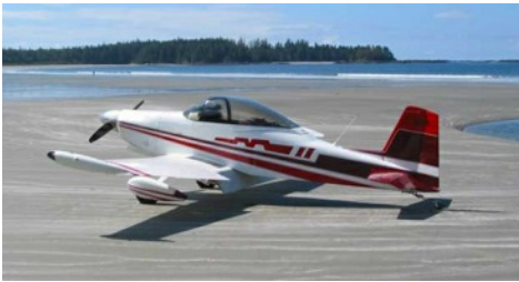
Mustang II C-GAIF