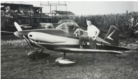
Midget Mustang N15J