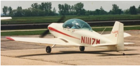
N1117M Bushby Mustang II prototype