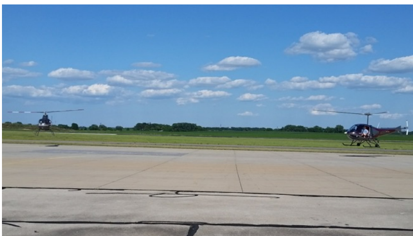
Tom Ellis and Matt Trofimchuck having helicopter time at the airport.

09 - Ugly Christmas Sweater Party - Pizza party/Movie night