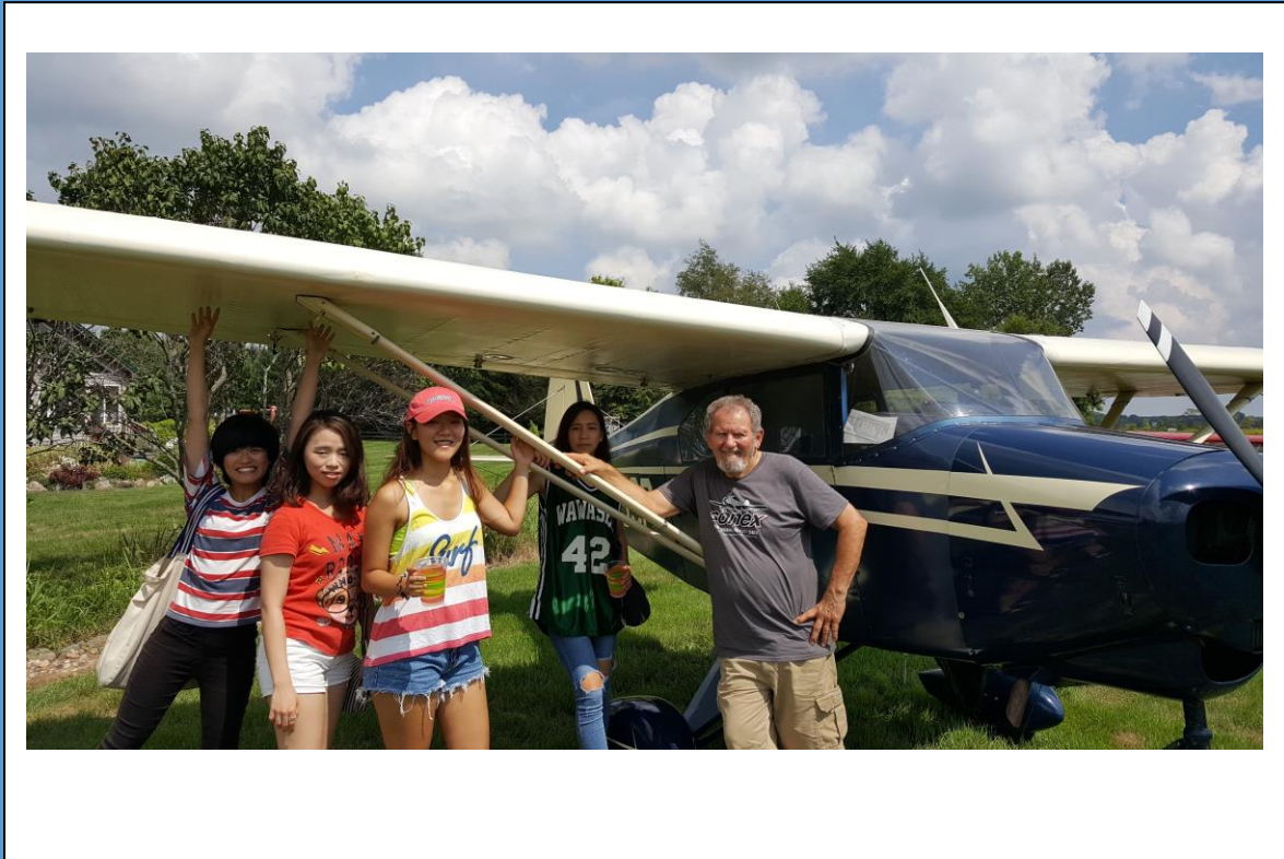
All the way from taiwan