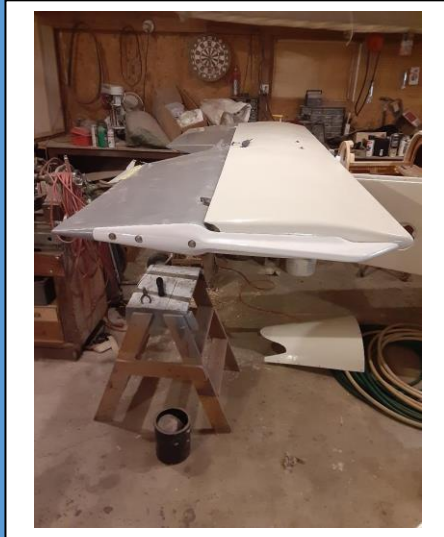
CHECKING BALANCE WEIGHTS ON TAIL ASSEMBLY