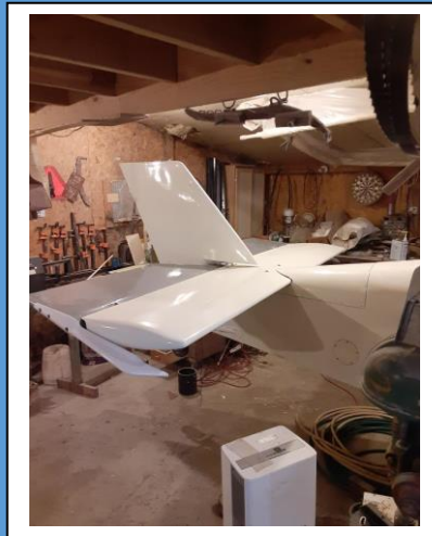
FULLY ASSEMBLED TAIL ASSEMBLY