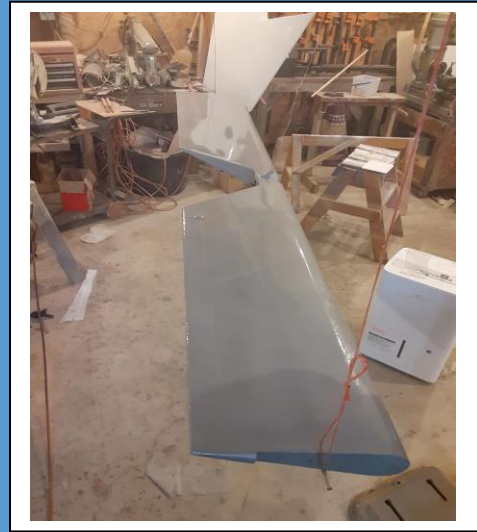
FRESHLY COVERED WITH HIPEC COVERING SYSTEM