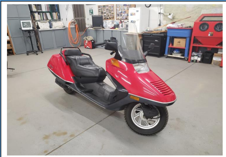
TURNERS TRANSPORT SPACECRAFT AT OSHKOSH