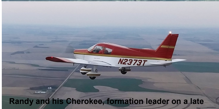
Randy and his Cherokee, formation leader on a late day flight on 4/24 to Creighton and return. A bit hazy but a nice flight in smooth air.