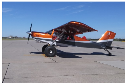
Rans S-21 at OFK - Montana airplane very well done.