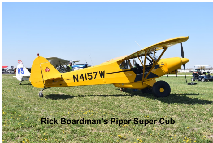
Rick Boardman's Piper Super Cub