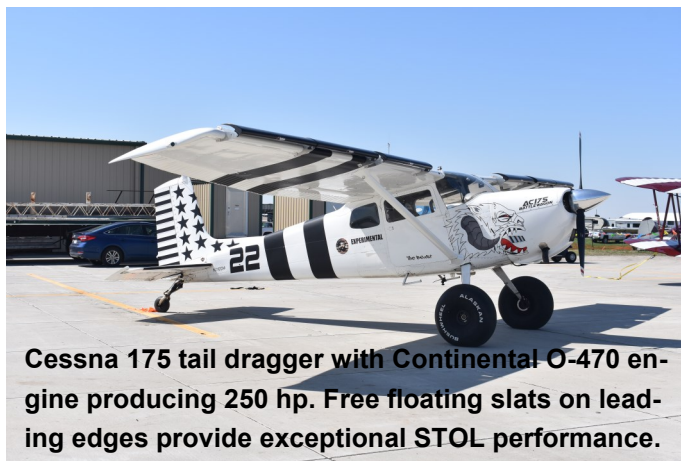
Cessna 175 tail dragger with Continental O-470 engine producing 250 hp. Free floating slats on leading edges provide exceptional STOL performance.