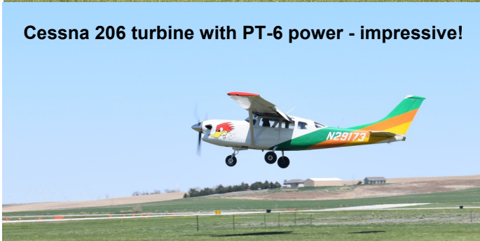
Steve Henry's specially built STOL machine. Well flown with nitrous injection for take off.