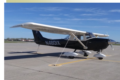
Nice looking Cessna 150 at OFK. Eloy, AZ craft has 150 horsepower Lycoming under the hood.