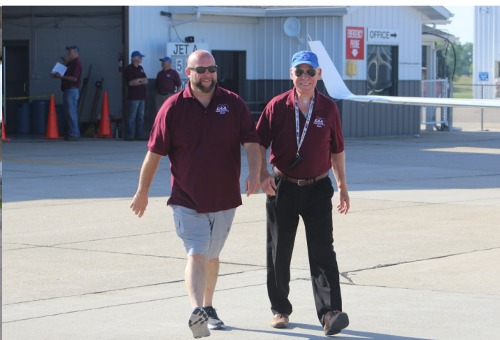
Even the pilots were smiling this day!