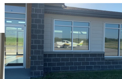
If you look carefully, you can see the Zenith reflected in the FBO window at Albion, NE. Nice facility...