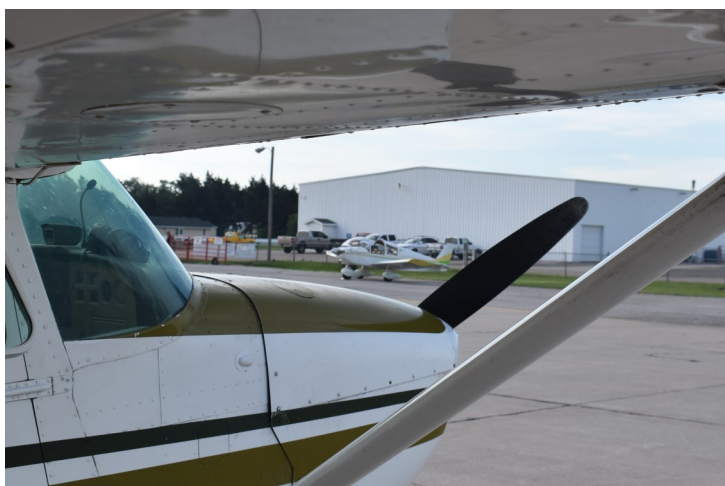
The Zenith all lonesome out there between the struts.