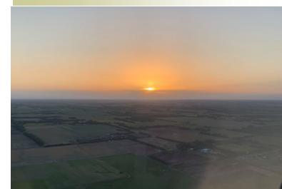
A hazy June sunset...and a nice evening flight. Ahhh...

GONE FLYIN' . . . YOUNG EAGLES DAY . . PG 4, 5, 6