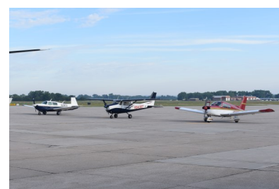
Waitin' on Young Eagles...a quiet moment before the action.