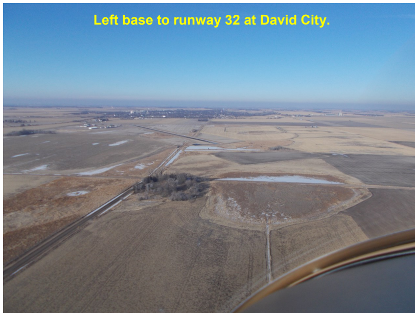
Left base to runway 32 at David City.

Got the annual done on the Zenith, so took her out for some exercise on the 14 th . Nice day, cold with light wind. Flew south a bit, taking a chance to start my quest all over again. Made a landing at David City with a bit of a cross wind. The field was well cleared, so no trouble, with decent landings on both ends of the flight profile.