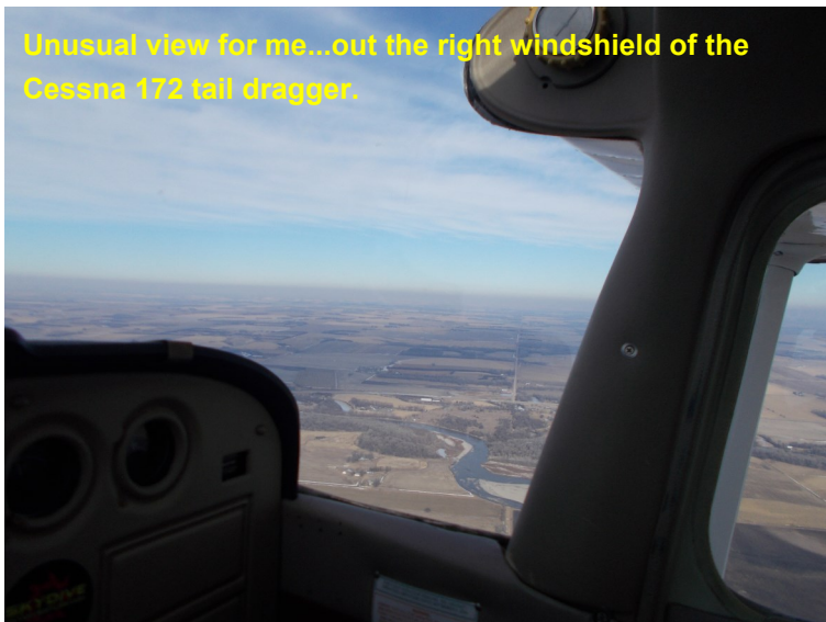
Unusual view for me...out the right windshield of the Cessna 172 tail dragger.

The Zenith was all ready to fly when Rich called, and as we taxied out, I discovered the intercom decided not to work. No trouble communicating on the radio but we went back to the old holler method of communications. We managed all right, and did some landings and air work before calling it a day.