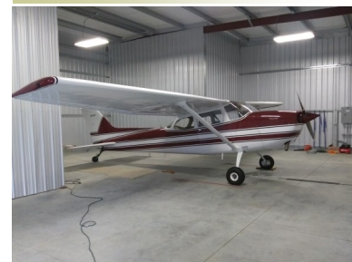
Unusual Cessna 172N...note where the nose wheel is.