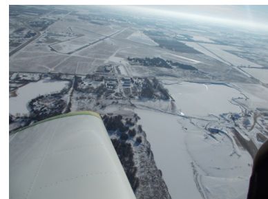
1/14/20 Turning out from takeoff on runway 2, heading west.