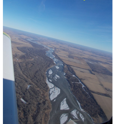
1/14/20 Platte River looking east on a beautiful day.