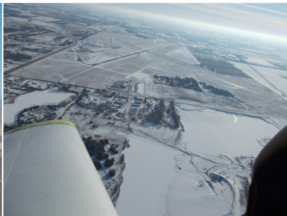
Notice the difference in the amount of snow from Norfolk, in the above photo, and the photo to the left of David City.