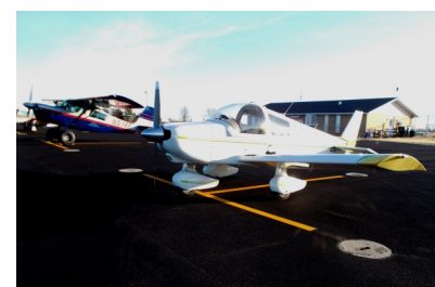
Early morning on the ramp at Sterling, CO with a Scout and Comanche.