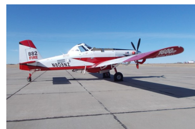
Air Tractor 802 'FireBomber' at Grant. This is a BIG airplane - 1600 horsepower!