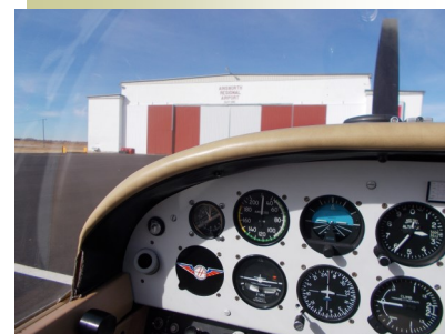
Old school panel on the ramp at Atkinson on a beautiful, sunny day.