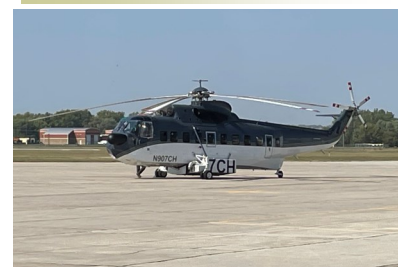
Sam caught this photo of a Sikorsky S-61 helicopter at Norfolk for fuel. Enroute to Michigan, the ship is set up as a fire bomber. BIG helicopter!