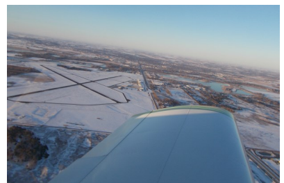
Left crosswind after takeoff from runway 20. The ground crew at OFK did a really good job getting the airport back in shape after the 5 inches of snow the day before. Late day flight...very nice!