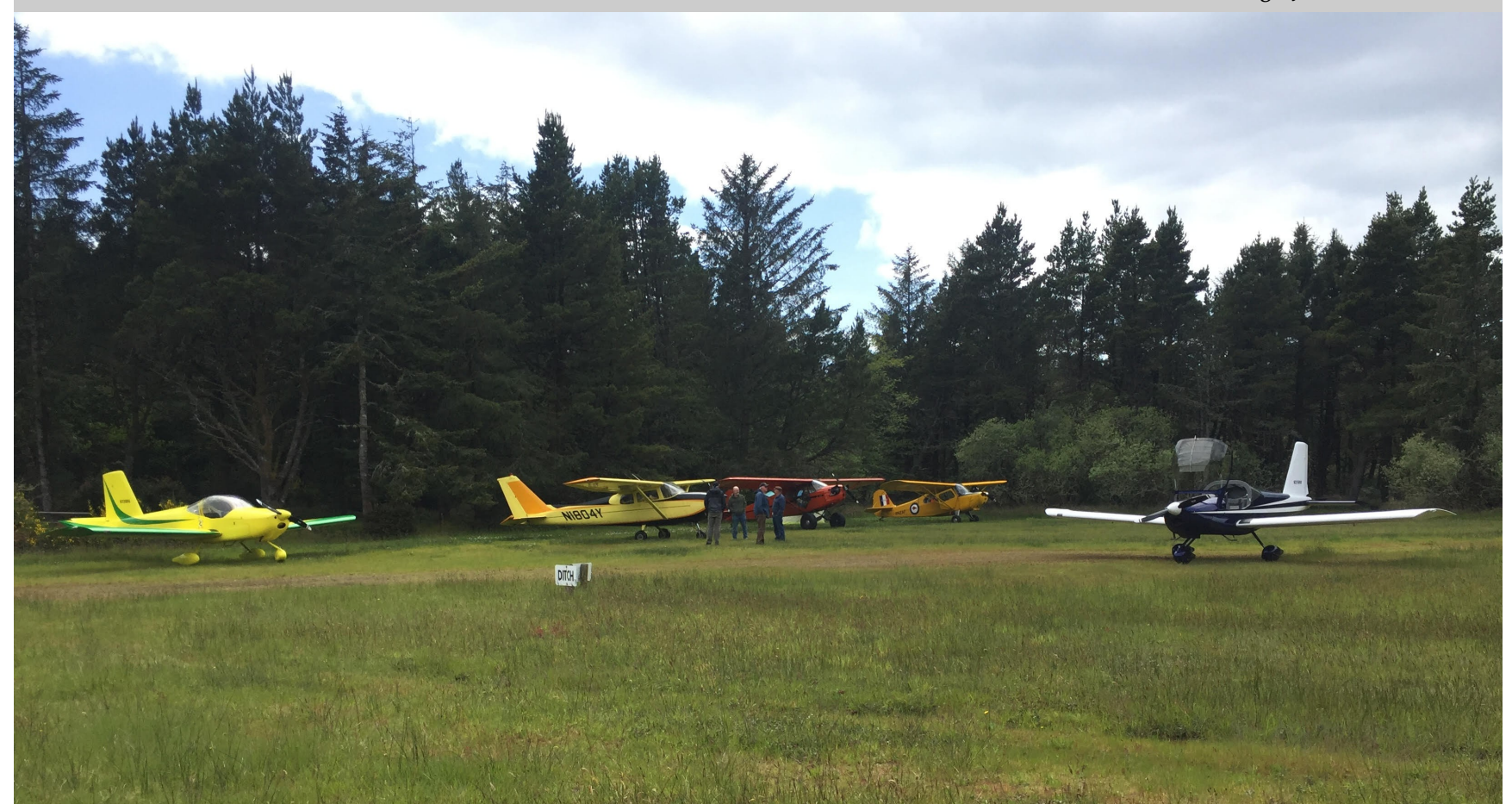
www. eaa902. org June 2022