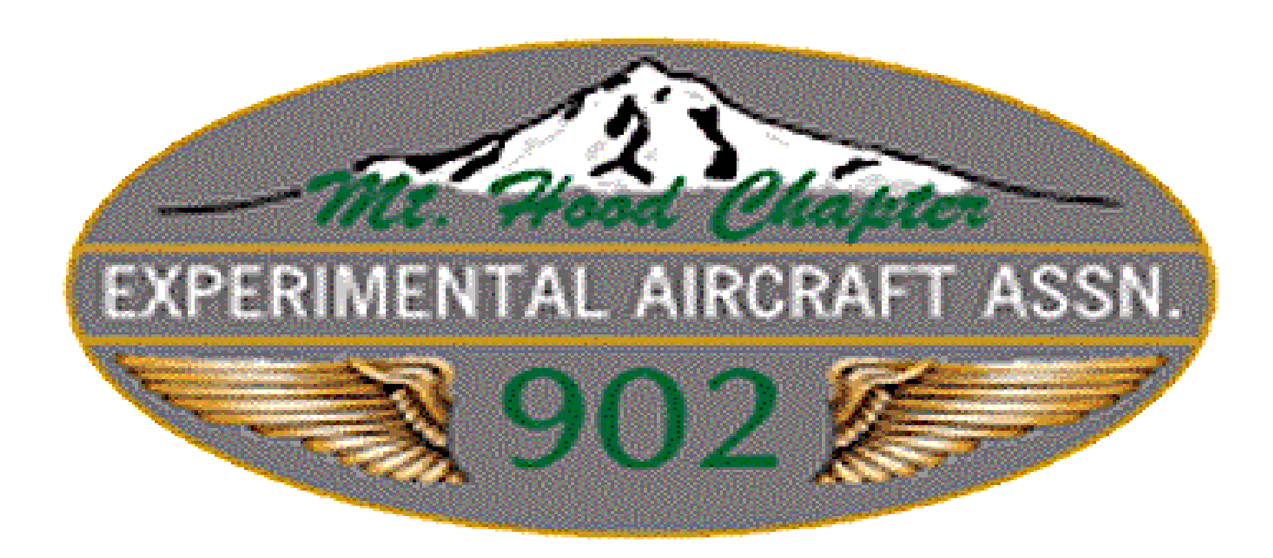
www. eaa902. org March 2021