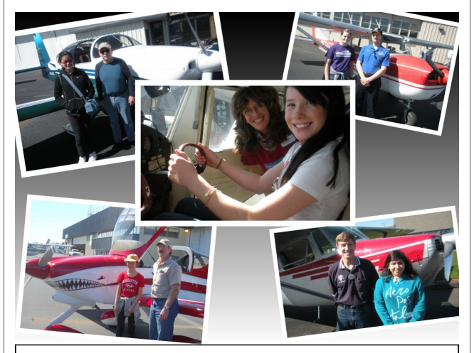
The chapter is still in need for a new Young Eagle Coordinator.