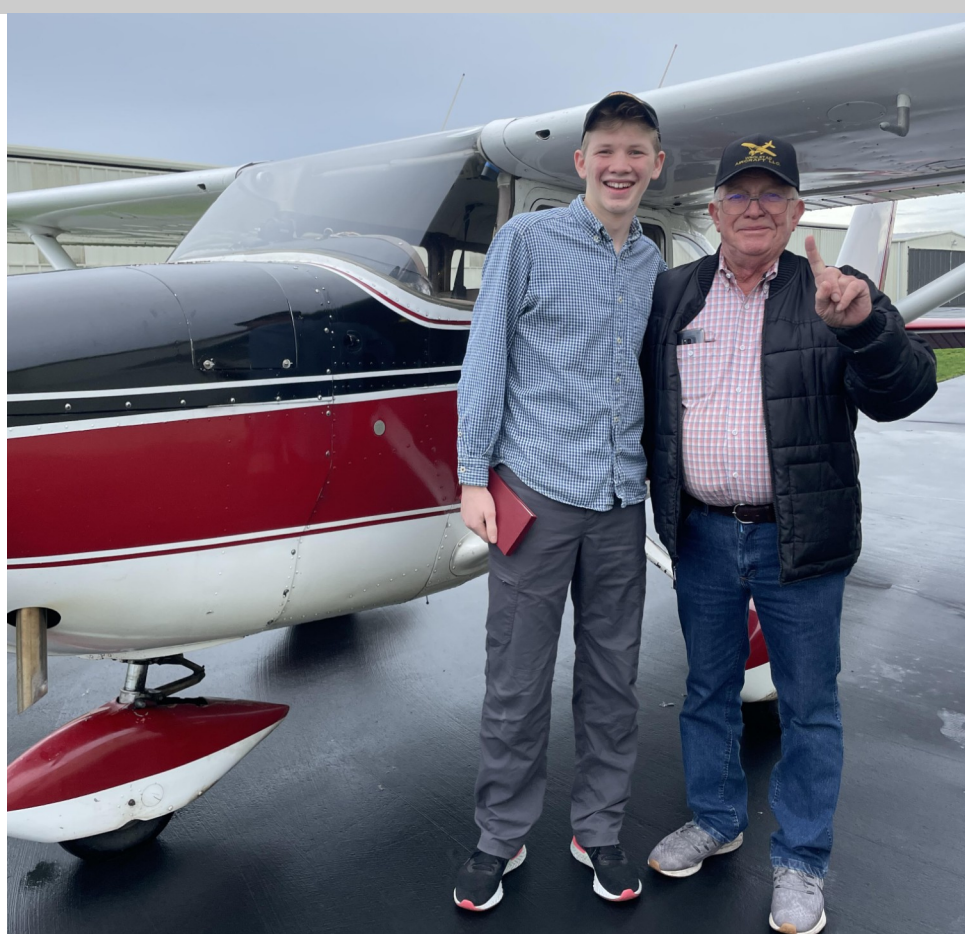
www. eaa902. org January 2022