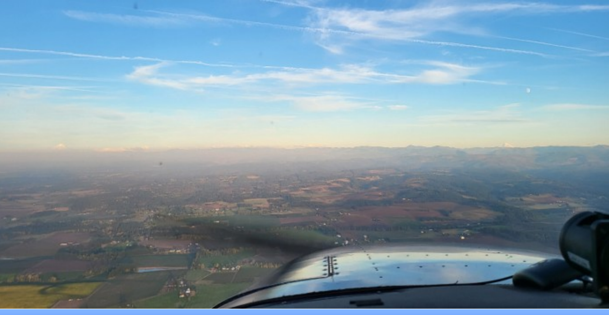
EAA Chapter 902

For the month of February, I only flew one time. My scholarship money was getting a little low and my DPE was not contacting me. I wanted to schedule my check ride for mid February, but the DPE was busy with other things. Now the checkride is scheduled for March 9th. I plan to fly at least one more time before the checkride as well as work on preparing for the oral exam. Learning to fly has been great, and I am really excited to finally get my license.