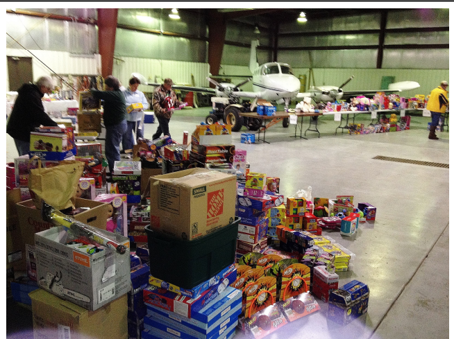
Mountains of toys were checked, sorted and bagged, thanks to many volunteers.