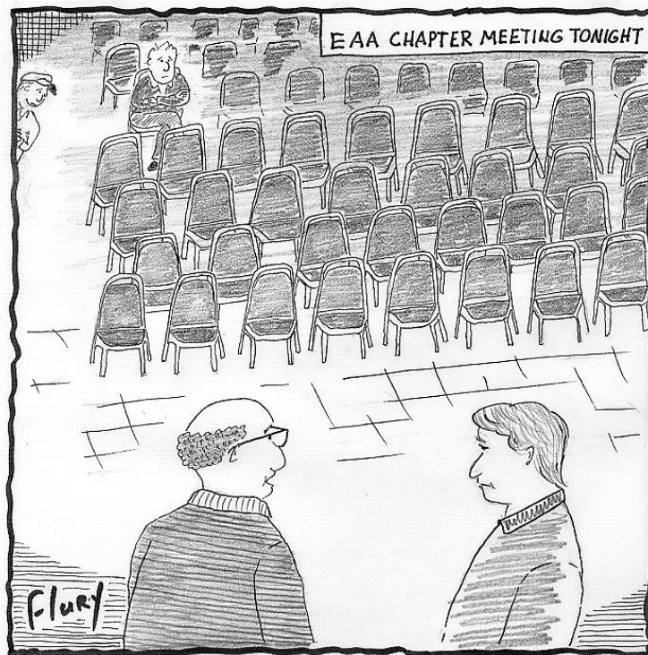
"Maybe we shouldn't have publicized that we were going to have nomination of officers and elections at the meeting tonight."