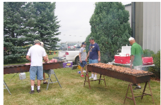
Our highly trained and experienced cooking staff delivered up another batch of delicious pork chops.