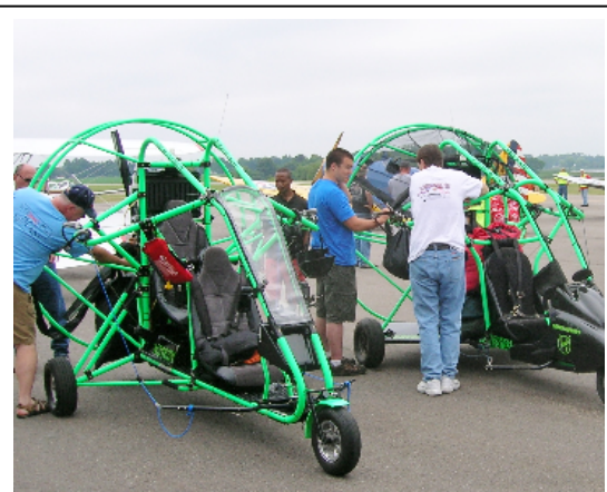
A pair of powered parachutes got a lot of attention.