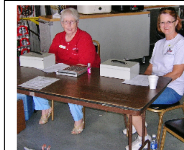
Pay at the end of the line (or else)!