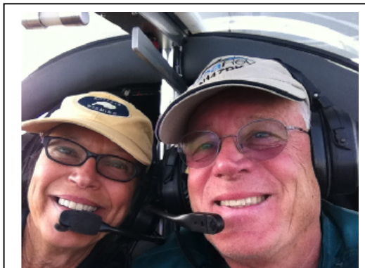
The happy flying couple!

Next we needed to fly to the cabin so I built a ramp up to the beach. First flight was great, with a stop at Motley to remove any weeds looking to relocate up north. I landed on Lake George and drove right up the ramp and parked. Getting ready to leave, I found we could not turn the tail in the sand, so we tried pushing backwards. The gear retracts forward, and as we pushed the tail moved forward and broke the retract cable. I knew you could fly with the tail extended, but I called