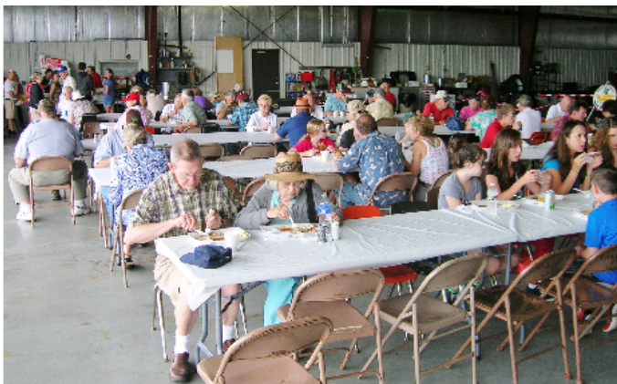
Lots of happy people eating lots of pork chops and hot dogs.

The low ceilings that hung around until after noon kept the number of fly-in aircraft to a minimum, but the drive-in traffic was steady throughout so we still had a successful day. Though we changed from our typical September Sunday date to this August Saturday (to coincide with the Maple Lake Gear-Head Get Together), there were still many familiar faces and airplanes in the crowd. Thanks to all the chapter members, families and friends that pulled together to make this another great event!