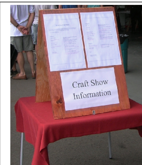
New for 2014, the Craft Show brought lots of new visitors to the airport.