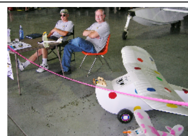
Our good friends in the Wright Flyers RC Club displayed some typical and not-so-typical airplanes!