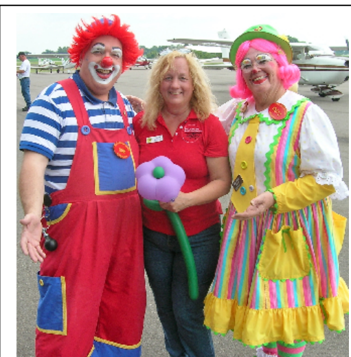
Airplanes and clowns made kids of all ages happy!