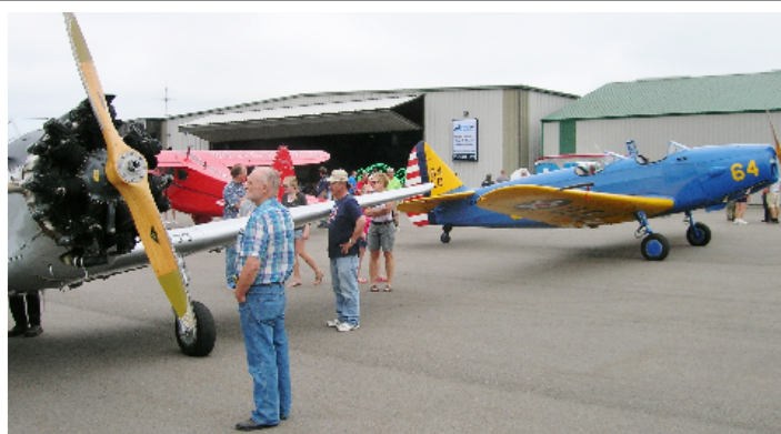
A PT-23A and PT-19 from Golden Wings Air Museum at Anoka.