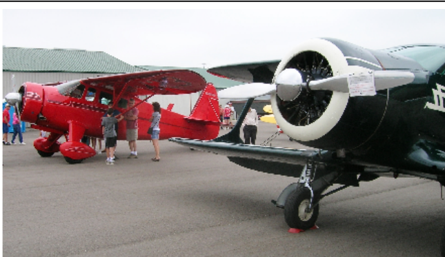
The classic lines of a Howard and Bill Mavencamp's Beechcraft Staggerwing added a touch of elegance to the flightline.