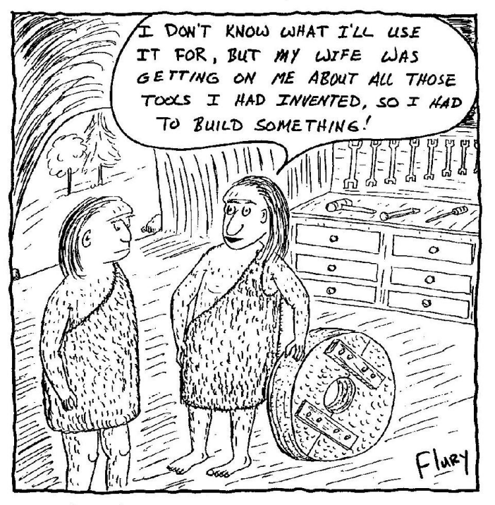
The real story behind the invention of the wheel.

This month's cartoon is a repeat from January, 2005. I ran out of time to create a new one...who knew retirement would be so time-consuming?!