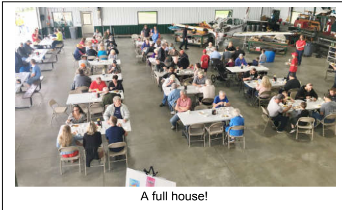
A full house!

Thanks to the Wright County Journal-Press for their excellent coverage!