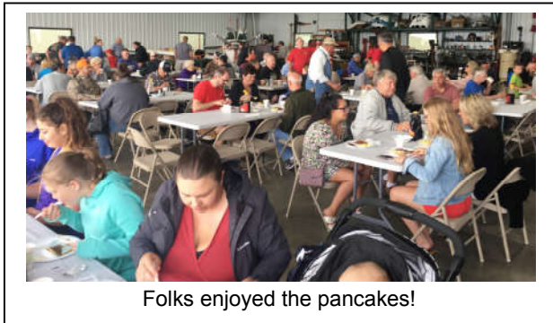
Folks enjoyed the pancakes!