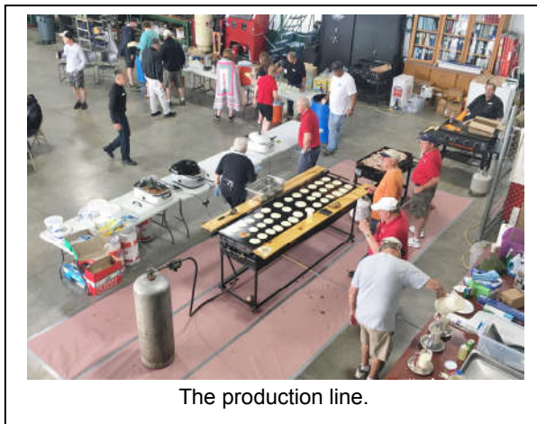
The production line.