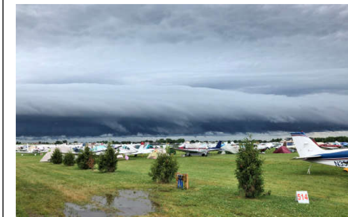
A wall cloud bearing down on the "North 40" aircraft camping area on Friday, July 19 where Greg Thomes and grandson Matt were hoping to stay dry in their tent (they didn't).