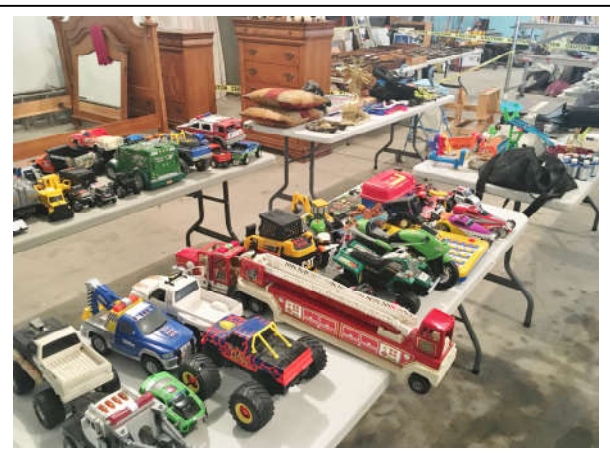
Toys, toys and more!