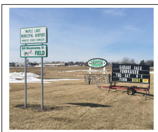
Making good use of our chapter owned mobile sign trailers!

I had fun, but it was also exhausting! Even so, we may even try another sale later this year! Keep cleaning out your house and making donations to the chapter!