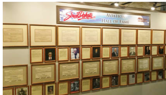
The museum is home to the South Dakota Aviation Hall of Fame display, honoring South Dakota’s aviation pioneers and notables.

The museum is immediately adjacent to Ellsworth AFB and not on the base property, so access onto the base is not necessary. Parking and admission is free, though there is a charge for the bus tour of the base and to a Minuteman missile silo. Just be sure to keep a firm hand on your wallet as you stroll the aisles of the gift store, particularly if you have grandkids with you!