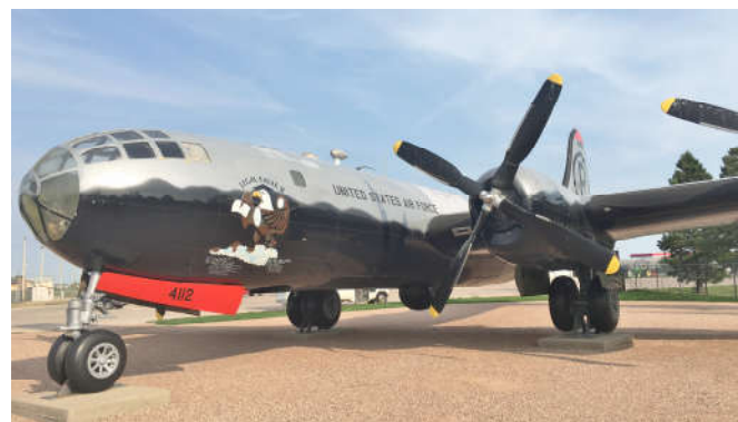
A prime example of the awesome B-29!

Next month: Part 3 – A Visit to the Air Force Museum at Dayton, Ohio