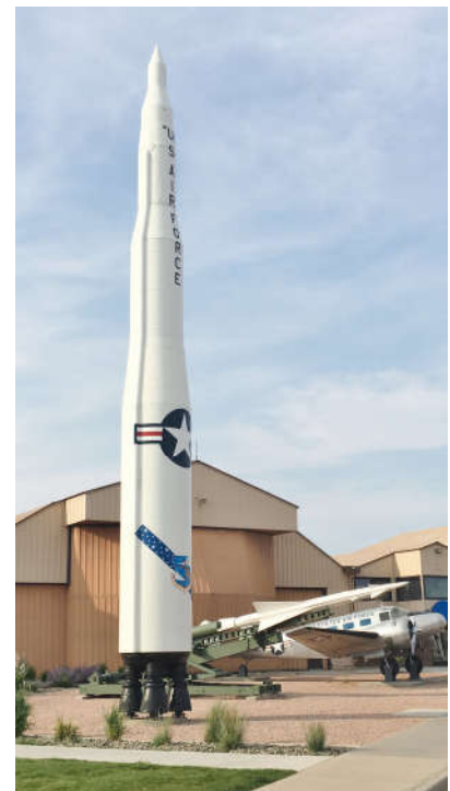
A Minuteman-II ICBM. Not as big as you might expect, but deadly. This 3-stage, solid fuel missile with nuclear warhead had a range of approximately 8100 miles, is just under 60’ long, 5’-6” wide at the 1 st stage base, and weighed 78,000# fully loaded. On my next visit I’ll take the bus tour from the museum to a now unused underground silo (where missiles were positioned with their launch crews).