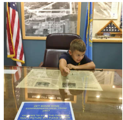
A future commander, no doubt!

This is a supersonic capable and features variable-geometry wings (may be positioned forward or swept aft, depending upon operational mode). The first production unit was flown in 1984. They were designed and configured for nuclear weapons, but under the original START treaty of 2007 were modified to be limited to conventional weapons only. Its maximum takeoff weight is 477,000#, of which 75,000# is payload.