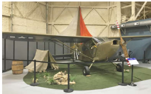
An L-5 Sentinel observation aircraft display.

As I noted at the end of the “Background” inset of this article, an Air Force base is much more than airplanes and pilots, though they are the most visible. Museums generally can’t explore this element well. Without the work of support, operations and maintenance personnel, airplanes and missiles would never see the sky.