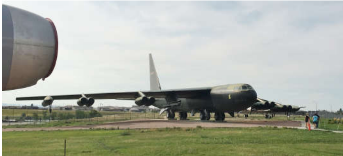
The mighty “Buff”...the B-52. Still active in the USAF inventory, but no longer based out of Ellsworth.