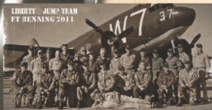
LIBERTY JUMP TEAM FT BENNING 2011

A tribute to the greatest generation of Americans during the 20th century's darkest hour... lest we forget.