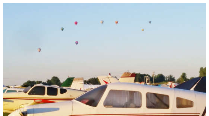
Saturday morning (early!!) balloon launch.

More photos and memories in next month's newsletter!