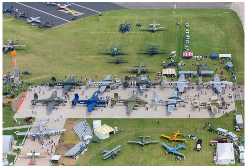
B-25's on Warbird Alley, plus one in the Warbirds in Review staging area. This was prior to their launch on the day they reenacted the Doolittle Raiders launch from the carrier Hornet.