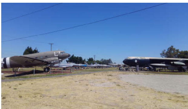
"Just plane cool!"

For more information, see https://www.midway.org/visit/plan-your-adventure/ .