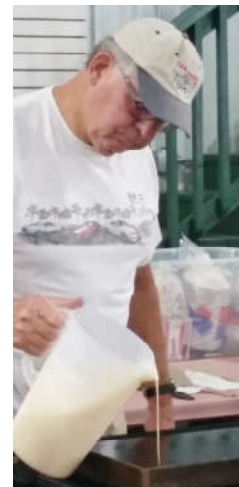
Buffalo Pancake Breakfast Fly-In, Car Show and Air Show, 2018