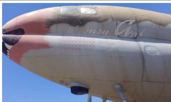
Curtiss C-46D Commando

For more information, see https://www.midway.org/visit/plan-your-adventure/ .