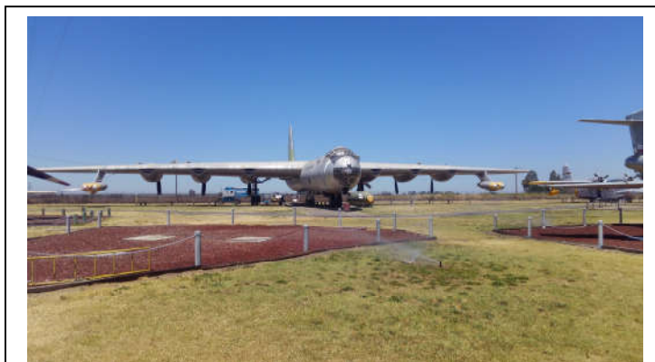
Convair RB-36H Peacemaker

The first week I was in San Diego for a week of training. I had set up my schedule so I had the later part of Thursday afternoon free from classes. The training hotel was located right on the boardwalk and a short walk to the USS Midway Museum. The 2 hours I had was enough to glance at everything but not study it in depth. This carrier, built the final year of WWII, was changed into a museum in 2004 and is a great static display of what an aircraft carrier is like. The size and types of planes flown from its deck – from props to jets – what a fascinating place to visit. They have a few WWII era fighters on display, but mostly the jets that were flown from the 1950's through the 1990's. A self-guided walking tour with audio stops is available for more information as you explore.