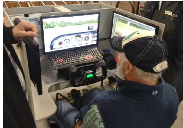
Dale flying in "auto-pilot" mode (hands-off). Note the 3-screen set up.

Chapter Airplane Build Project: This project is currently tabled.