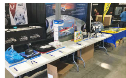
Silent auction items.