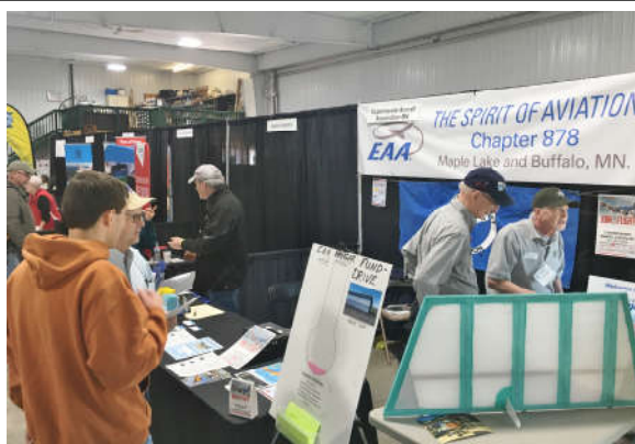
Exhibit booth for all EAA chapters in attendance.