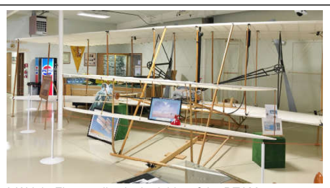
A Wright Flyer replica in the lobby of the DTAM.