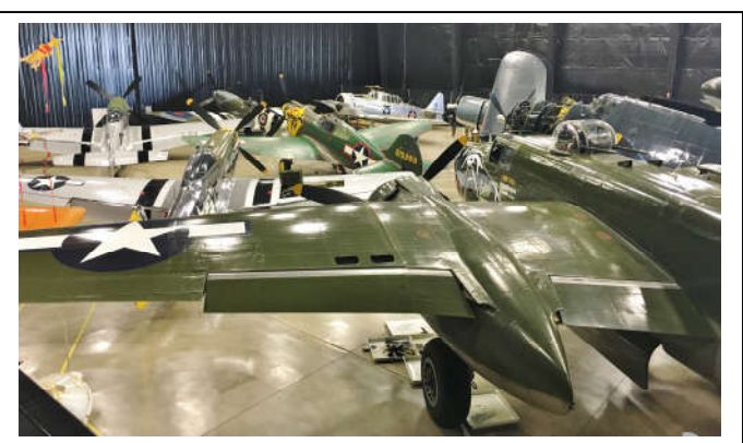
A view of just one of the hangars at the DTAM. This is what you might call a "full house!"

I really wanted to visit the Dakota Territory Air Museum (http://www.dakotaterritoryairmuseum.com/) (DTAM). Of course it has a focus on local aviation pioneers, leaders and history, but it also has a cooperative exchange of aircraft with the Texas Flying Legends Museum near Houston, TX. As a result, they have a lot of