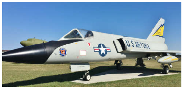
The F-106A (single seat) Delta Dart. We also had two of the F-106B (two seat) versions of this Mach 2+ aircraft.

I really wanted to visit the Dakota Territory Air Museum (http://www.dakotaterritoryairmuseum.com/) (DTAM). Of course it has a focus on local aviation pioneers, leaders and history, but it also has a cooperative exchange of aircraft with the Texas Flying Legends Museum near Houston, TX. As a result, they have a lot of