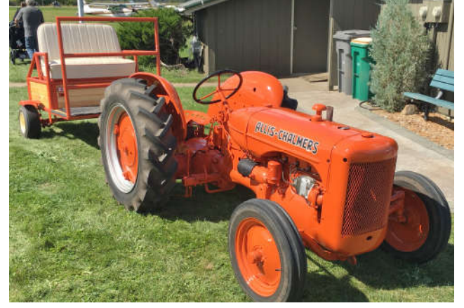
Yeah, I know this is a newsletter about airplanes, but I grew up with a fondness for Allis-Chalmers tractors and thought this was an appropriate vehicle for use as a people mover. Note the "dropped" front and rear axles!

When we left Taylors Falls we crossed over into Wisconsin and drove Hwy 35 south to Osceola.