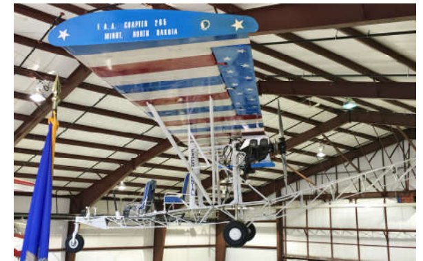
I belonged to EAA Chapter 265 at Minot but was not very active. This Breezy had been built by that chapter. If I remember correctly, the nose wheel gear "may" have had a military origin!

On the south side of the airport sits a sparkling new and impressive International Terminal. Minot is served now by Allegiant Air, United Airlines and Delta Air Lines, plus it has a FedEx shipping center. At the time I was there, the only service was by North Central Airlines (yep, I'm that old!).