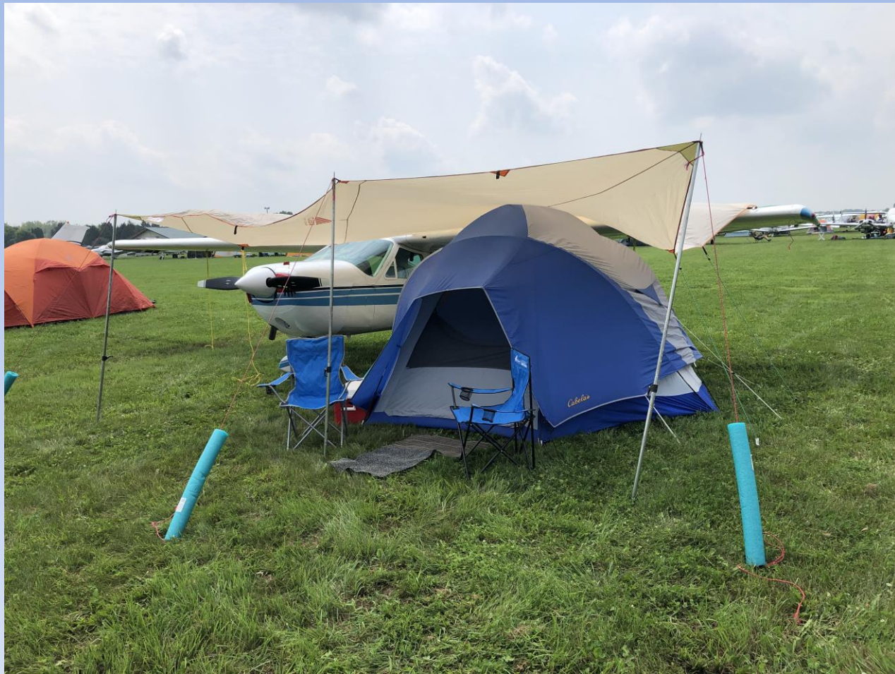
Oshkosh Set up