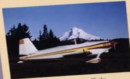
The RV-4 prototype poses – likely somewhere in Oregon.