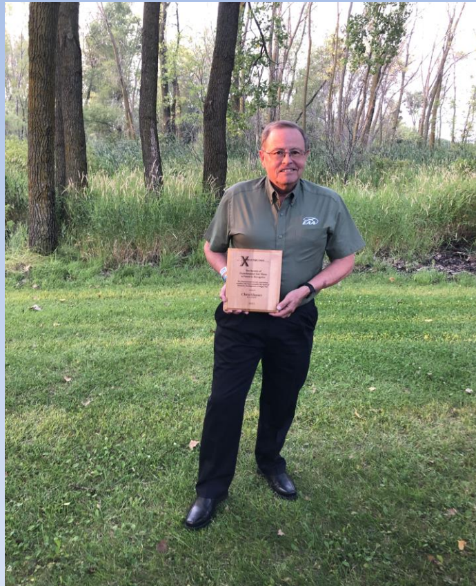
Spirit of Flight Award