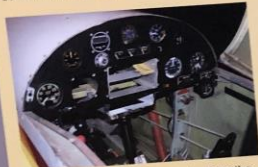
The RV-4's cockpit is a bit busier than the RV-3 with room for more avionics and an intercom for the rear seat passenger.