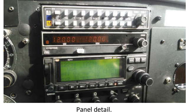
i anci actan.