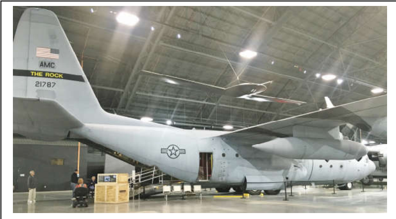
The Lockheed C-130 Hercules (this one is an "E" model) was my first USAF assignment aircraft as a Maintenance Officer. I got to know them very well while stationed at Ton Son Nhut AFB, Vietnam.

To give you a sense of the size of the hangar, the top of the tail of a C-130 is at 38'-6".