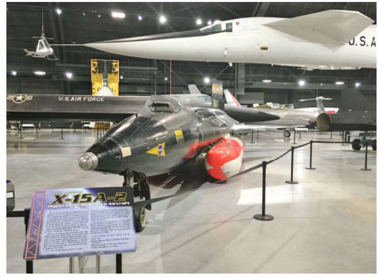
In the presence of some fast company in the Research and Development Gallery! Foreground – the North American X-15 (the red/white thing is an external fuel tank); above and to the right – the nose of the North American XB-70A Valkyrie; and low to the left – the Lockheed YF-12A (predecessor to the SR-71). Note the American Helicopter XH-26 "Jet Jeep" just off the nose of the Valkyrie! R&D isn't just for superfast stuff!