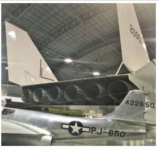
The "business end" of the Valkyrie. Designed in the late 50s, first flight of this Mach 3+ aircraft was in 1964, but was retired by 1969.

The museum is also home to the National Aviation Hall of Fame, <a href="http://www.nationalaviation.org/">http://www.nationalaviation.org/</a>, located within the facility.