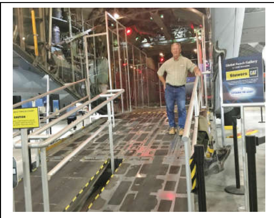
I wish the C-130 had been included in the SE Asia War Gallery since these aircraft could, and did, haul almost everything into and around Vietnam. This particular aircraft is displayed in the "Global Reach" gallery in the new "Fourth Hangar."

To give you a sense of the size of the hangar, the top of the tail of a C-130 is at 38'-6".