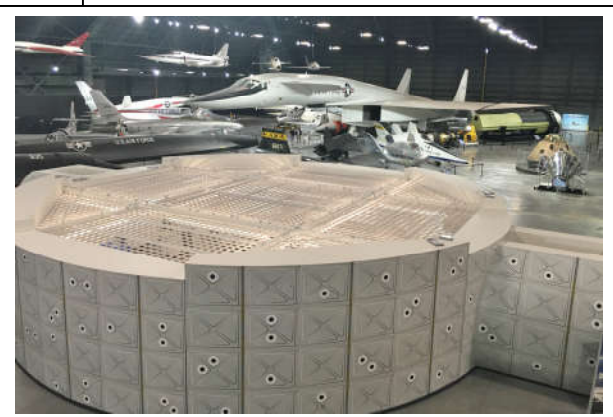
Valkyrie and others in the background. The round structure in foreground is a STEM classroom for visiting students.

Dayton Aviation Heritage National Historical Sites The Wright B Flyer WACO Museum & Air Field Armstrong Air & Space Museum Wright State University Wright Archives Aviation Trail, Inc., Visitor Center & Museum Grimes Flying Lab Foundation