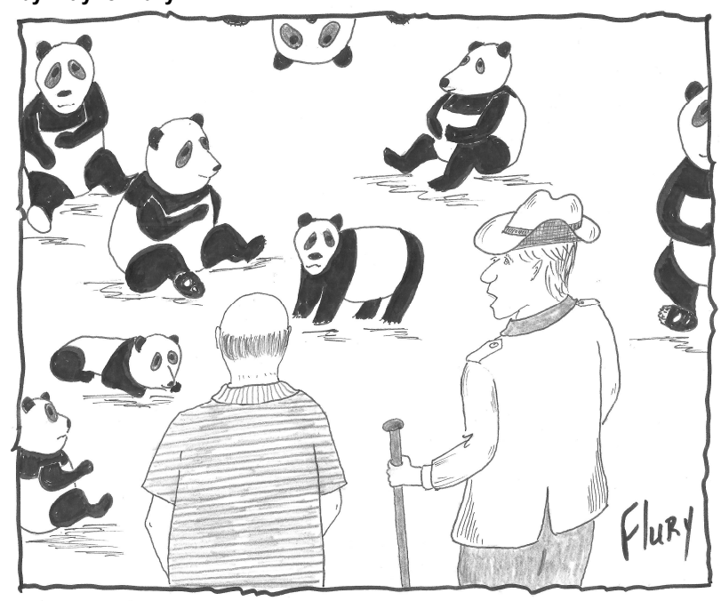
"By Jove, I do believe we are in the midst of a pandademic."