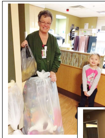
Hospital staff and their helpers were very happy to receive this bounty!