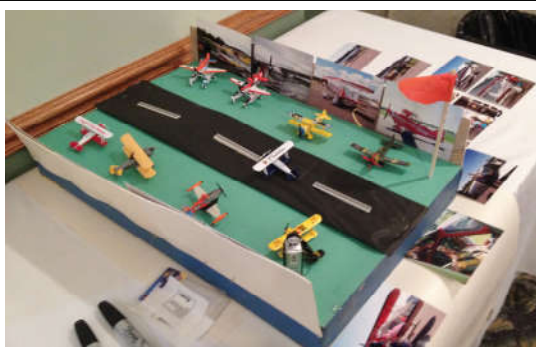
A table-top display of photos of favorite airplanes by Wyatt and Connie Erickson. Note the windsock and the fuel pump!