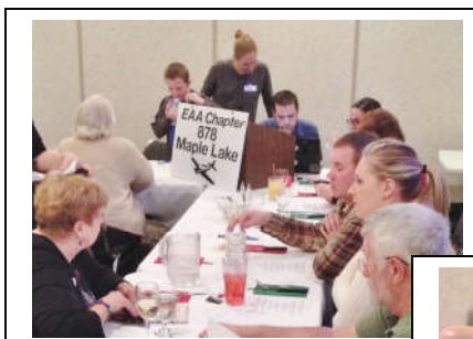
A great evening of socializing, dinner, entertainment, recognition and awards to chapter members.