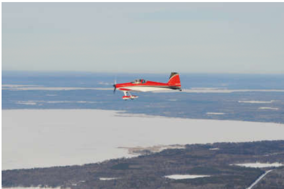
Warren Starkebaum's RV-7 over one of the 10,000 lakes!