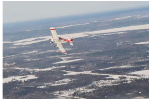
Peeling off to explore the lake country!