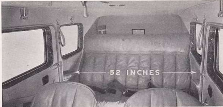
(Motor car width at elbows across rear seat)

Not only the most spacious and comfortable