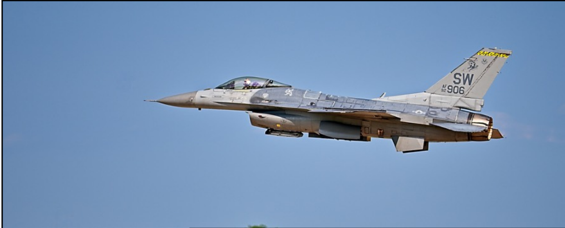
General Dynamics / Lockheed Martin F-16 Fighting Falcon