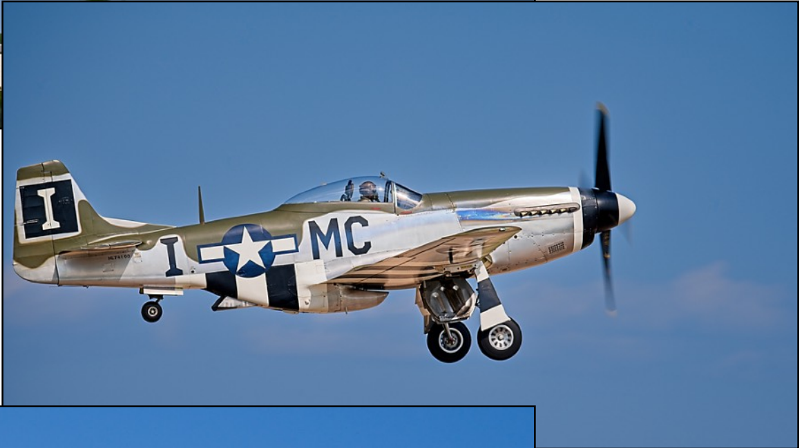
North American P-51D Mustang