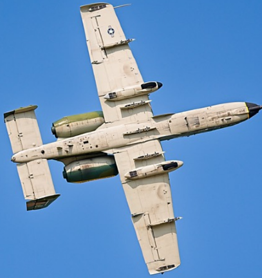
Fairchild Republic A-10 Thunderbolt II “Warthog”