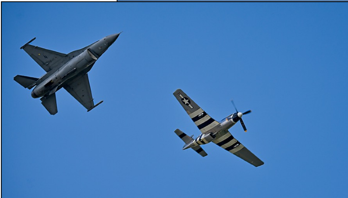
USAF Heritage Flight