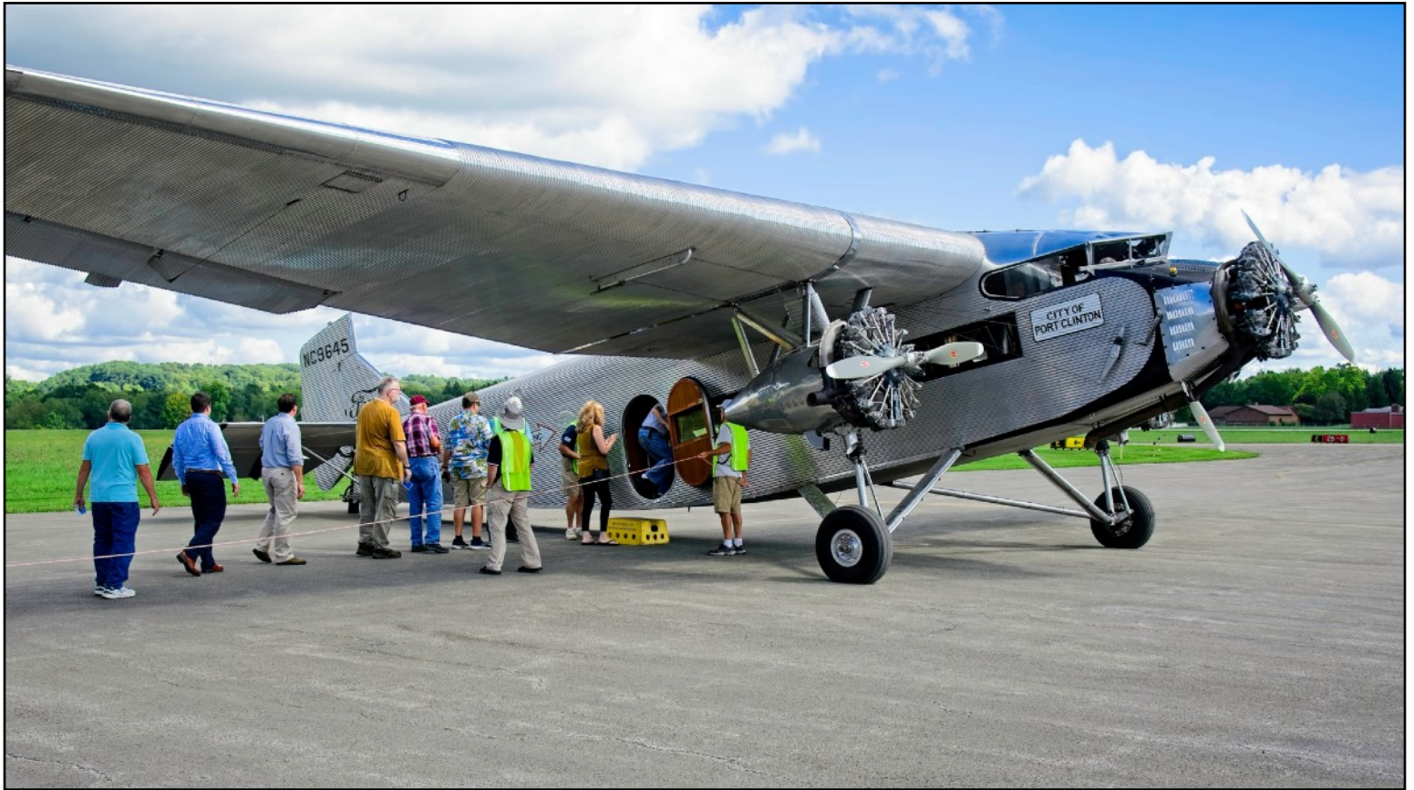
Our first passenger flight loading onto the 1928 Ford Model 5AT-B Tri-Motor manufactured by the Stout Metal Airplane Company, a division of Ford Motor Company.