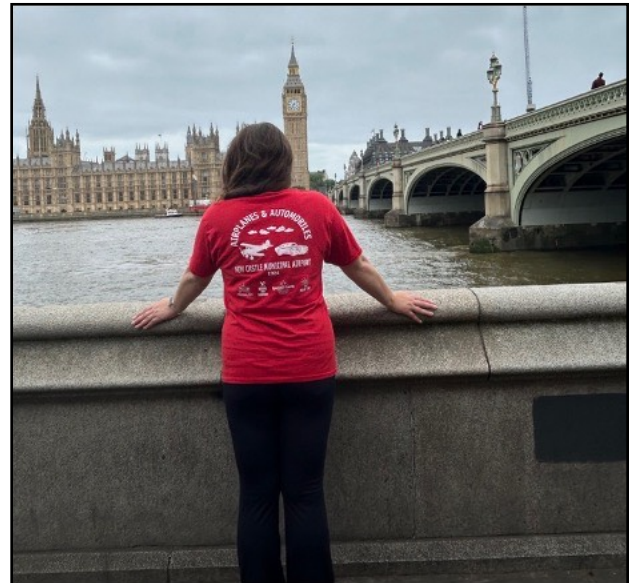
Airplanes and Automobiles “global marketing”

The classic phone booth. These were plentiful across the city. You would think with the invention of the cell phone that these would disappear, but London seems to keep them around. I share this picture because my mother was grossed out having to pick up this public phone to pose for the picture. I told her “it was part of the birthday experience”.