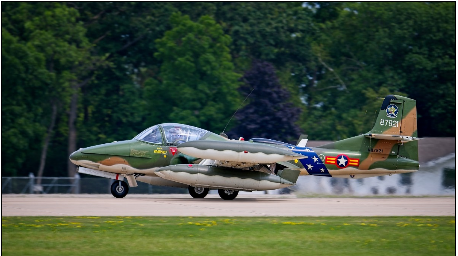
Cessna A37B Dragonfly