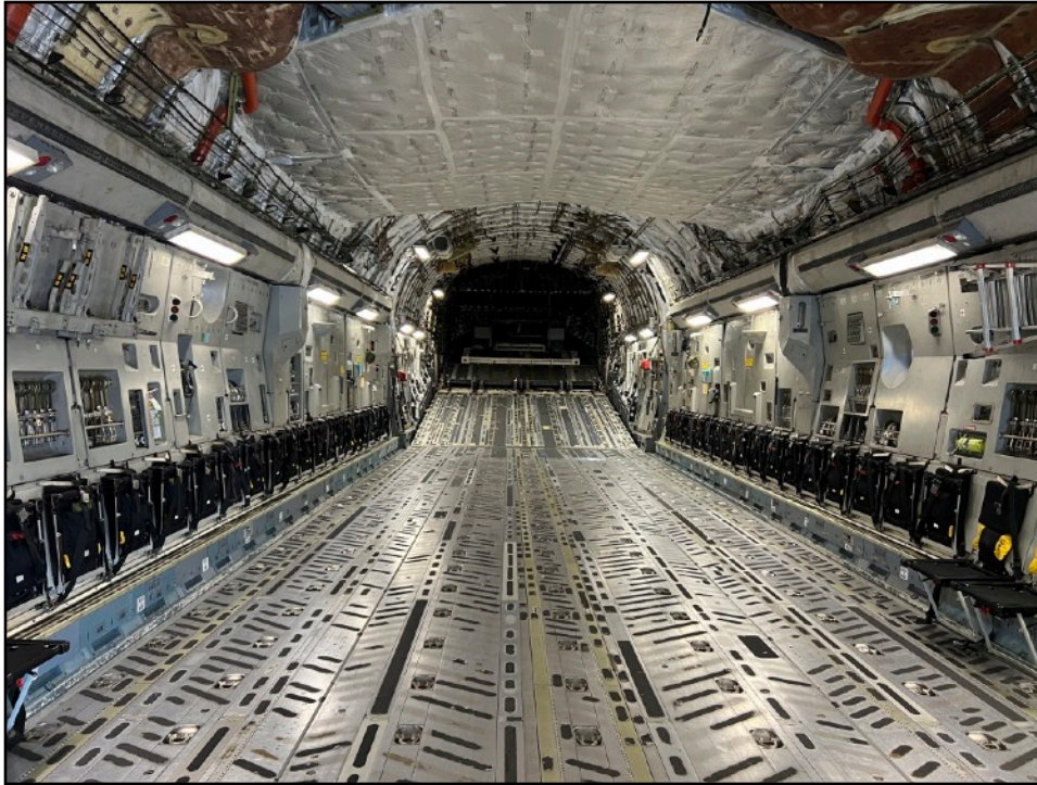
Cargo bay facing the back of the aircraft.

Every section of the floor flips to reveal rollers, hooks, and any type of connector you can imagine.