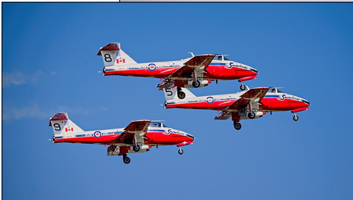
RCAF Snowbirds Demo