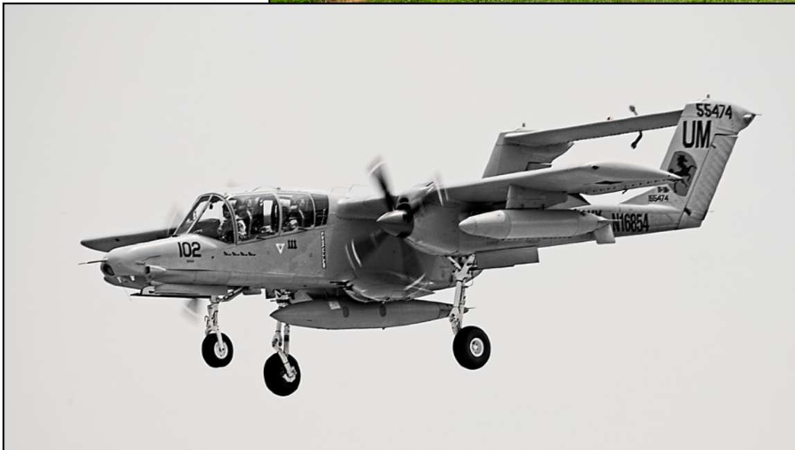
North American Rockwell