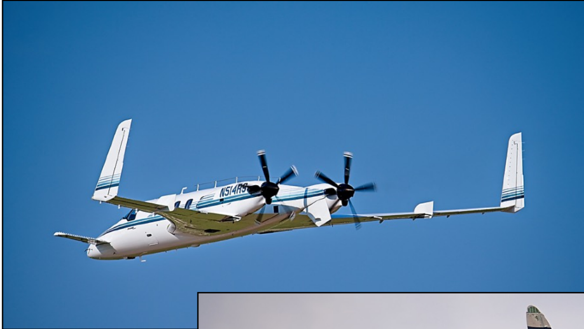
Rutan / Beechcraft