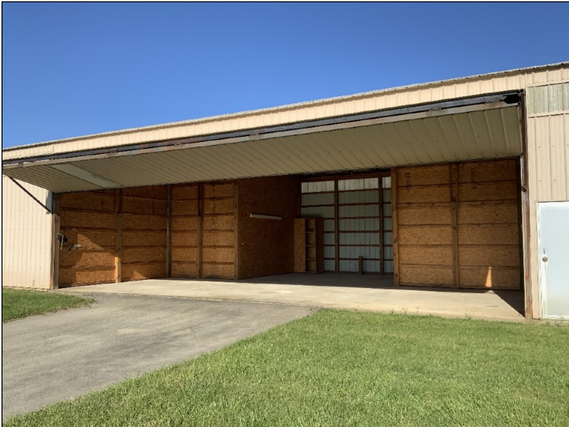
Chapter 857's Hangar at KBTP

Chapter 857 has entered into an initial lease of Hangar S9, #2 at KBTP and is now accepting input and reservations to use the space for aircraft builds and restorations.