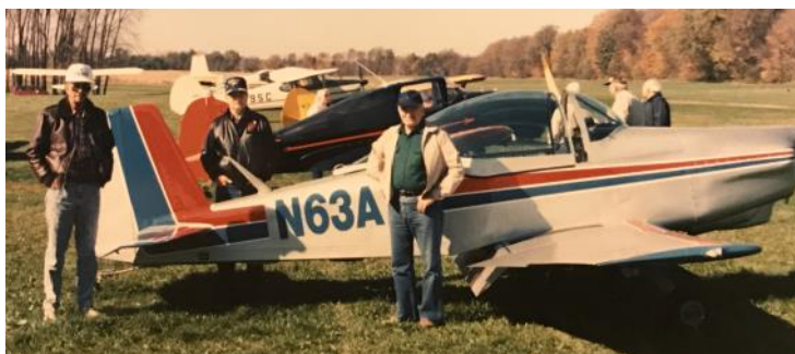
The ten-year anniversary celebration of the chapter in 1995. 18 of the 35 chapter members attended.