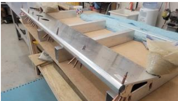
Flap under construction