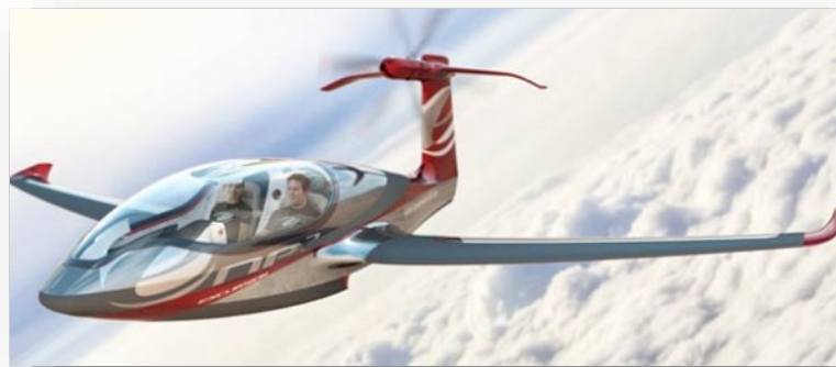
Next Chapter Project...?