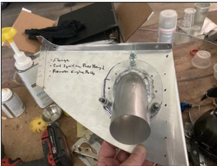
More baffle work...