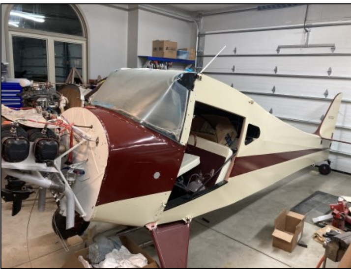
Partially finished Taylorcraft fuselage.