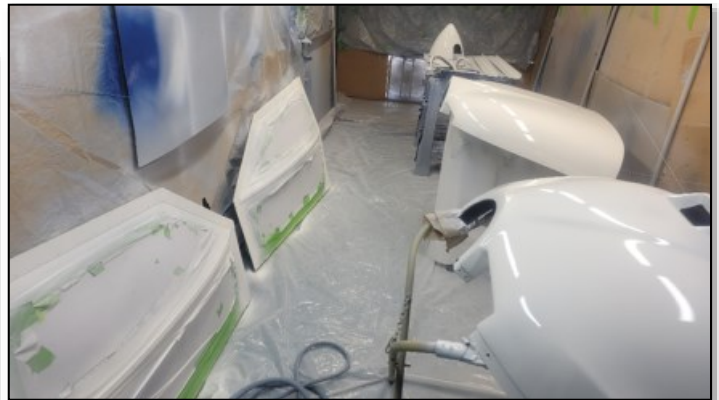
Cowling and door painting