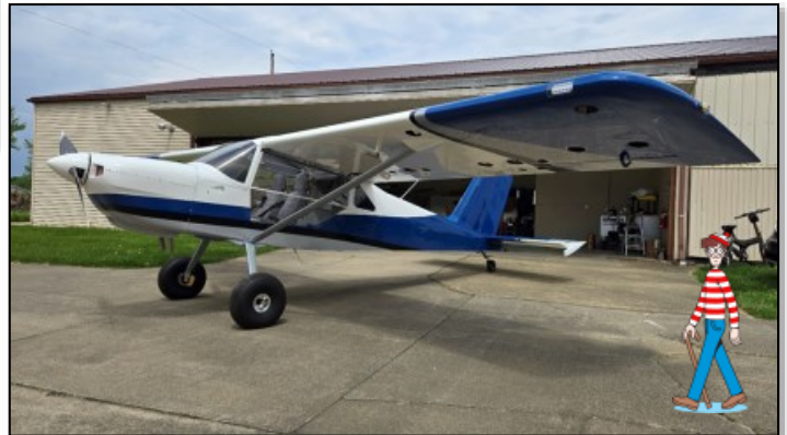
Finally finished painting!