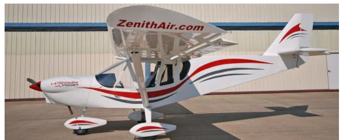
Factory Demonstrator Aircraft

I have a project blog, http://n622jc.com/ and my worklog ( http://n622jc.com/work-log/ ) entries all have photos if you are looking for anything. Nothing spectacular, but we have the rudder done, the horizontal stabilizer is 98% done, and the elevator 75% done. We also powered on avionics (on my desk) on Friday. We will not get the remainder of the kit until Nov 2nd. So, once we complete the elevator (maybe today) and then attach it to the horizontal stabilizer, we're done building until then. We will begin working on wiring avionics though.