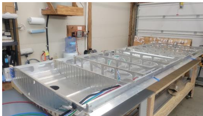
Left wing in jig ready for pitot tube, fuel tank and bottom skin install.

Building my S-21 kit is well underway. All the tail feathers are completed, and I just finished riveting the top skin and gap seals on the left wing. Ron L. and Dave M. came over the other day and we flipped the wing over so I can start work on the bottom skin. I need to fabricate amount for the heated Garmin pitot tube that I am using and install the OAT probe on an inspection cover. I'll tidy up all the wiring in the wing and then fit and rivet the bottom skin. Finally, I'll install the fuel tank after assembling the fittings on the tank and installing the fuel filler cap. The tank is a 21-gallon, one-piece poly tank. After the left wing is completed, then I'll start on the right wing. Hopefully, it will go a little quicker, due to less wiring and having built the left wing already. Stop by anytime to check out the build.