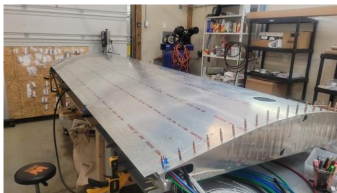
Left wing top skin and gap seals installed. Root rib not riveted yet to allow for fuel tank install.