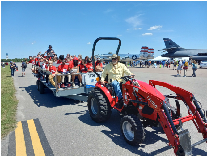
Hauling Students @ Sun & Fun