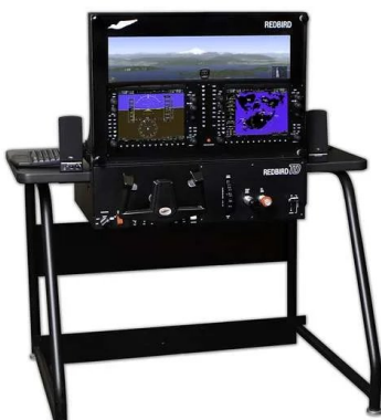
Generic Picture for illustration