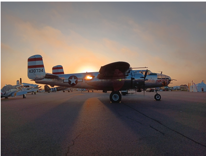
Sunrise @ Sun & Fun