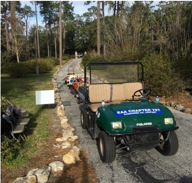
Chap 797's Kiddie Ride @ Heritage House